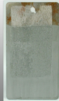
BACKBONE REINFORCING MESH

Forms an Invisible Patch Made of Unbeatable Strength & Holding Power