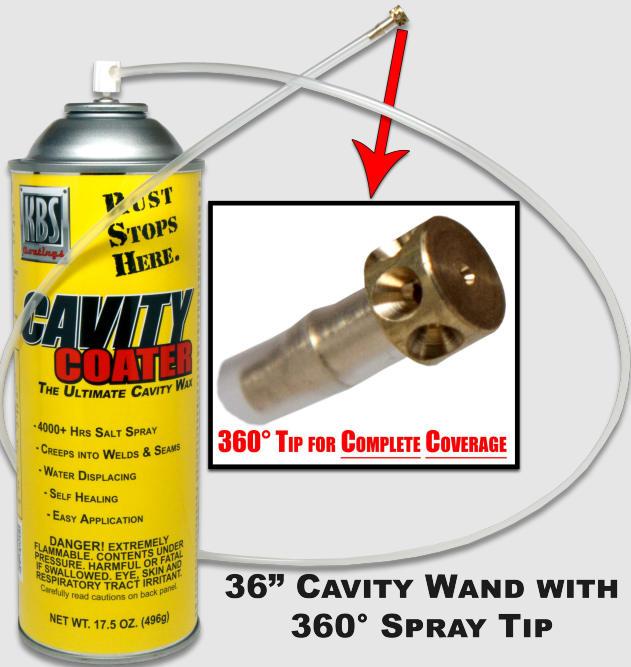
36" CAVITY WAND WITH 360° SPRAY TIP